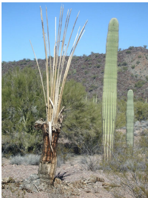
Figure 4.1: Living and dead saguaro cacti ( Carnegeia gigantea ) plants in the Sonoran Desert, Arizona, USA. Solar UV radiation (280–400 nm) can influence the growth and development of living plants as well as the decomposition of dead plant material (litter).

In addition to these molecular advances, research conducted by ecosystem ecologists has identified UV as an important driver in the decomposition of dead plant material (i.e., litter). While ecologists have known for some time that UV can influence decomposition (e.g., via effects on decomposing microbes and litter chemistry), the report by Austin and Vivanco (2006) was the first to convincingly demonstrate that UV could have a strong, positive effect on litter decomposition via the process of photodegradation. This study was conducted on grass litter in Patagonia, Argentina, and sparked further investigation by a number of other researchers to examine UV-driven photodegradation in arid and semi-arid ecosystems in North